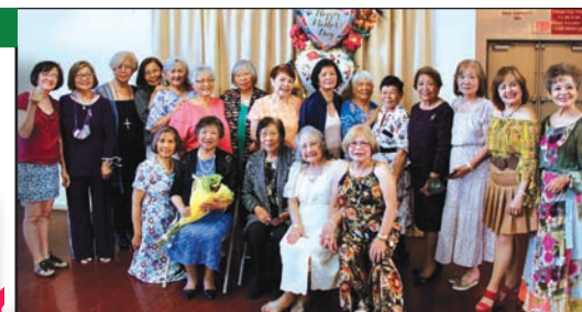
P9 Filipino Women's Club