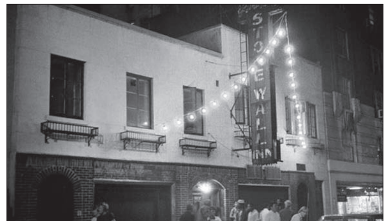
Stonewall Inn, a bar located in New York City's Greenwich Village that served as a haven for the city's gay, lesbian and transgender community.

The events at Stonewall Inn were a turning point in the