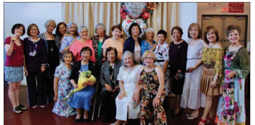
Mothers, members and Families