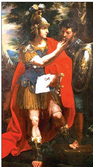
Alexander the great and Heptathlon

Surely, Alexander the great battles will be likened to the War on Ukraine waged by Vladimir Putin the President of Russia where thousands of civilians were being collaterally killed