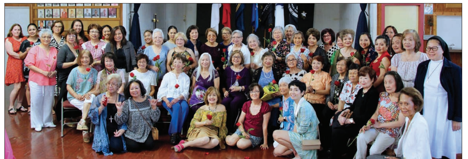
The Filipino Women's Club members and guests