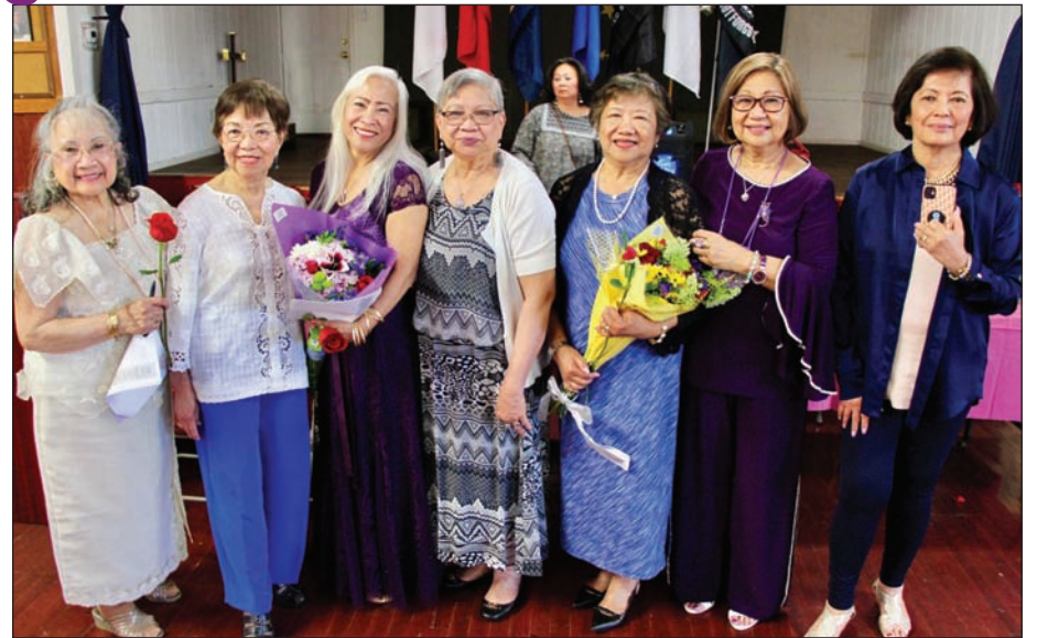
Filipino Women's Club officers and Moms of the year