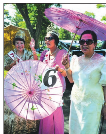
Mrs. Ilocano foundation of California

esta. There are five corporate sponsors whose generous funds sustained our commemoration of our Philippine Independence Day on a yearly basis. The recognized partners are SMUD (Sacramento Municipal Utility District), East Lawn Memorial Park, Seafood City, Kaiser Permanente, and Parkwest Casino Lotus. Our yearly sponsors were invited by Sponsorship Committee