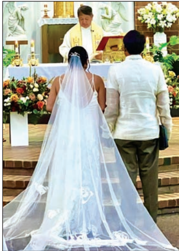
Readings and Blessing

While preparing to entering the hot spring resort, I was approached by a person. As I looked over at this person, I see Lancelot! Like a sudden rush of shock,