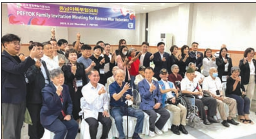
P8 Filipino Soldiers of Korean War