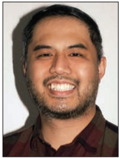
BY BENJAMIN ABAYA