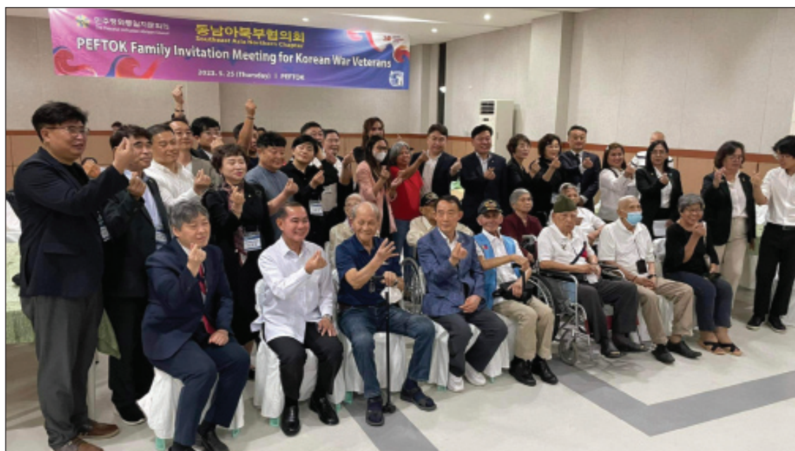
Filipino soldiers of Korean War