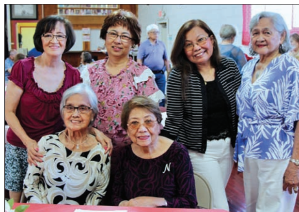
FAVA and Auxliary ladies