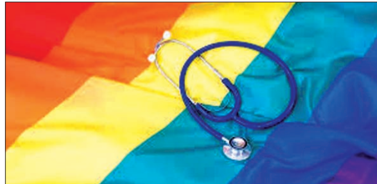
June is recognized as Pride Month

As we peruse the pages of our ancient history, we have encountered many interesting facts with reference to our subject matter, so unbelievable that we scanned further to determine such factual conception if ever. We found out that a great warrior who conquered vast territories of the ancient world was himself a gay person.