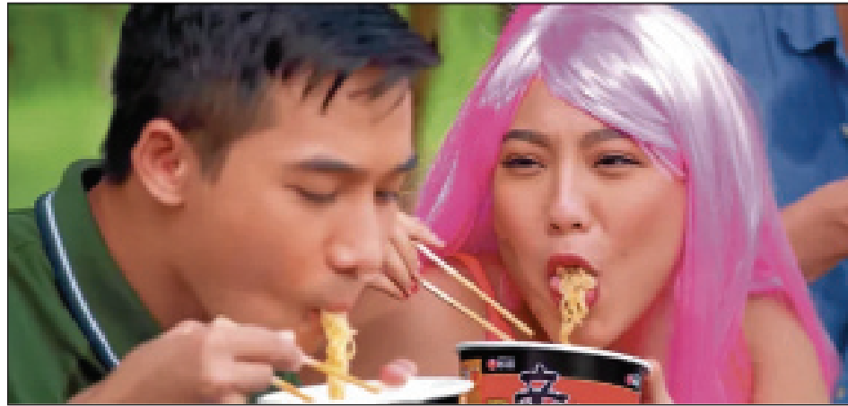
Scene from “Huling Ulan sa Tag-araw”