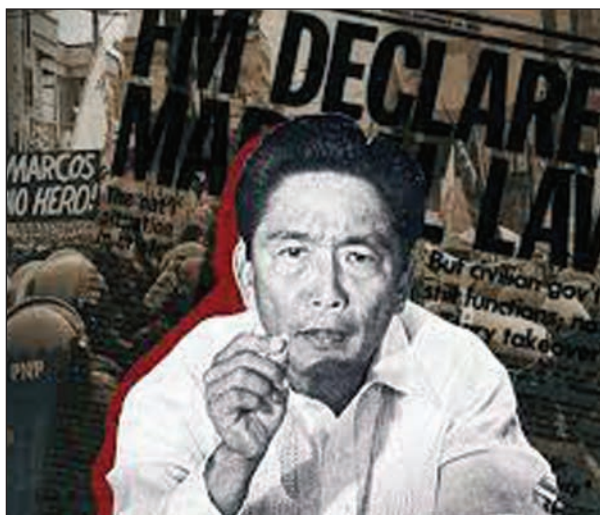
Ferdinand Marcos declares Martial Law

After his first term as president, he started planning how to stay in power after his second term, which would have ended in 1973. Marcos started planning and he formed two sets of advisers, a 12-member working group called the Rolex 12, with each member given a gold Rolex watch as a symbol of power. Rolex 12 was composed of generals and economic cronies. They were the architects of the martial law plan. But within this group was another group, known as the Omega Five, which consisted of the generals who were also part of the Rolex 12. Their main responsibility was to make sure that Marcos would remain in power. They were the Praetorian Guard whose loyalty was unquestionable.