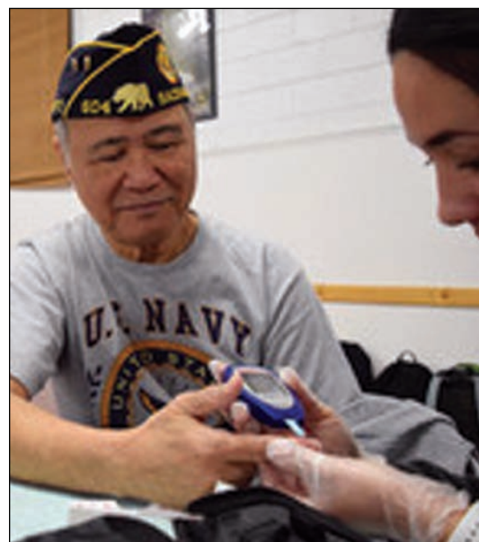
Helping the Filipino WWII Veterans

The Bayanihan Clinic familia consists of Undergraduate Volunteers, UC Davis Medical and Physician Assistant Students, and volunteer physicians. The small, tight-knit community serves the Sacramento underserved population by providing preventative medical