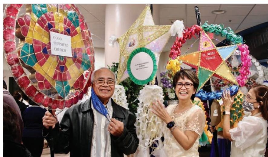
The Parols of Good Shepherd, St. Maria Goretti and St. John

The Filipino Apostolate of the Catholic Diocese of Sacramento (FACDS) invited this representative of PF News to attend. The editors of PF News express