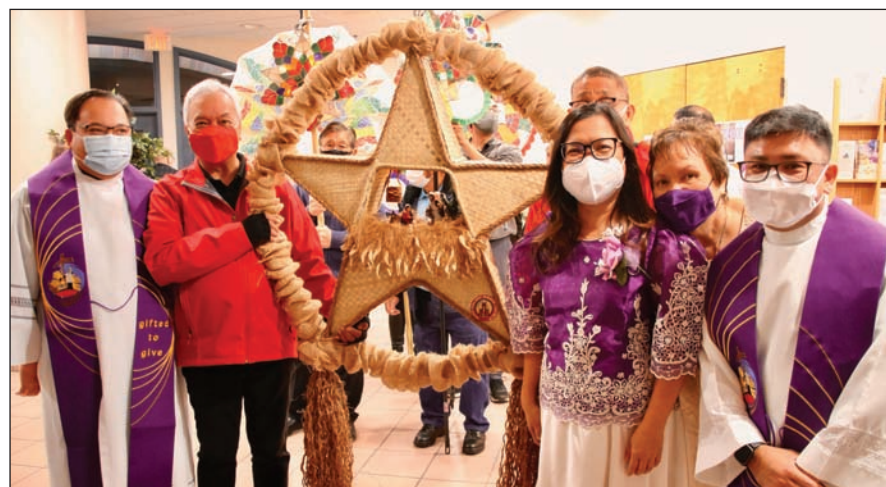
The St. John The Baptist Parish Parol