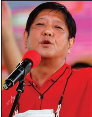
"Bongbong" Marcos Jr.