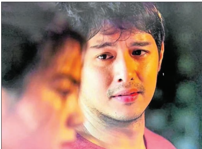
Scene from “Broken Blooms”

laki’, Bongbong Marcos says at rally as crowd looks for son Sandro