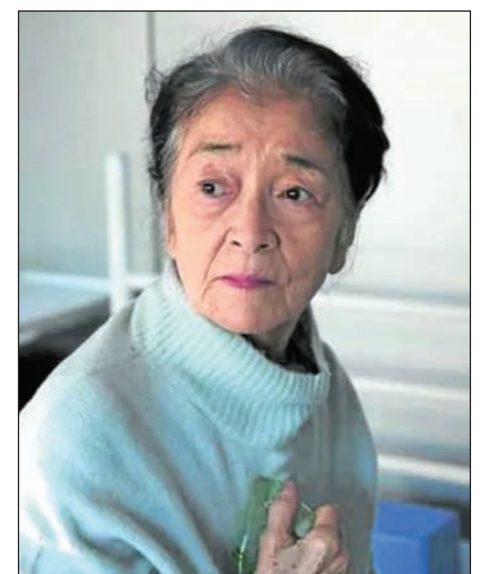
“Plan 75” lead actress Baisho Chieko

The festival in France will run from May 17 to May 28.