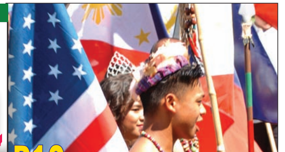
P12 Filipino Fiesta of Sacramento 2022