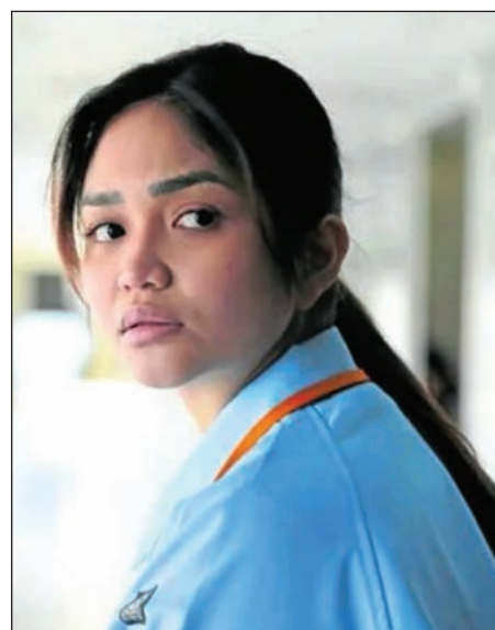
Fil-Australian actress Stephanie Arriane

is getting used to subtitles and dubbed movies and series. My goal as a producer is to make sure that Filipino representation is present and promoted in future content. I’m hoping when foreign viewers are getting used to us and our type of sensibilities, they’ll consume more of what we make here locally,” Fredo further said.