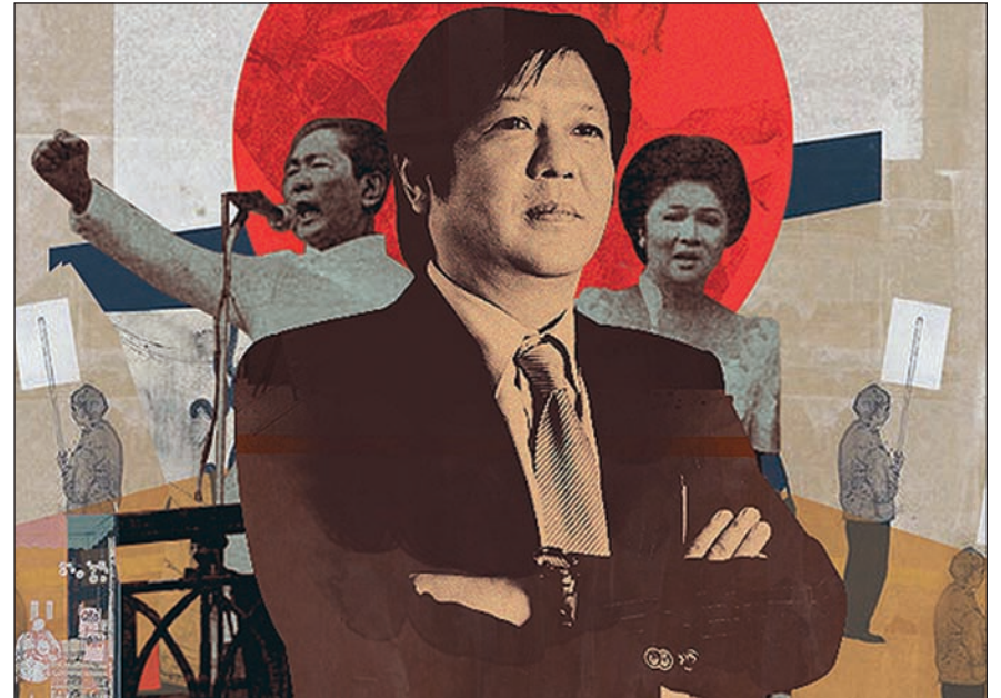
Ferdinand Marcos, Jr. and Imelda

On February 25, 1986, the People Power Revolution ousted the Marcos dictatorship. Ironi-