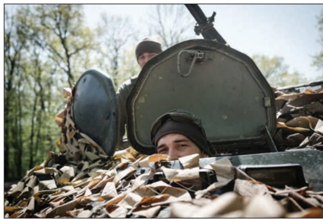
Ukrainian soldiers sit on a Armoured personnel carrier (APC) near Sloviansk, eastern Ukraine, on April 26, 2022, amid the Russian invasion of Ukraine.

"It took some effort but the Soviet sculpture of the two workers — symbolising the reunification of Ukraine and Russia