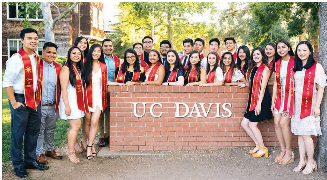
The Bayanihan Clinic of UC Davis