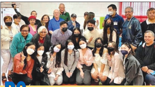
P6 Bayanihan Clinic