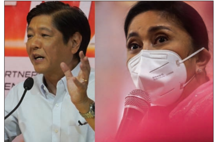
Ferdinand Marcos Jr. and Vice Pres. Leni Robredo