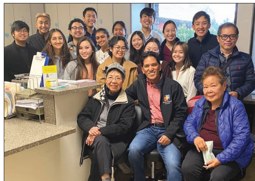
With The Filipino Community Leaders and Volunteers