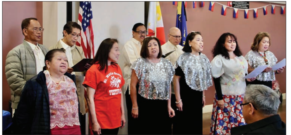
The VOOM Choir entertaining during the fellowship in the St. Gabriel Room after the mass.