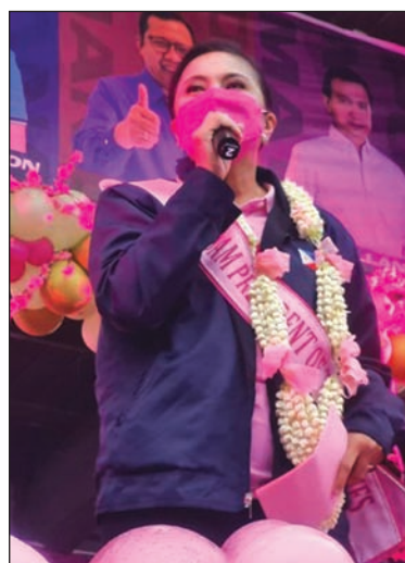
Vice Pres. Leni Robredo

Speaking to another mammoth crowd, this time the attendees of her slate in Sta. Rosa, Laguna, Robredo exclaimed that the her supporters, collectively called Kakampinks, may have the weather godsson their side, noting that even light