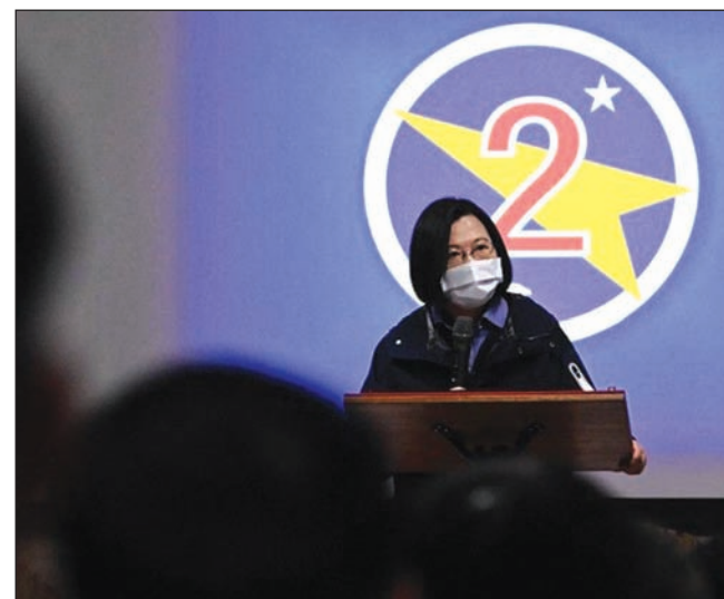
Taiwan's President Tsai Ing-wen speaks to Air Force pilots at a military base in Hsinchu.

It includes information on basic survival skills for the public during air