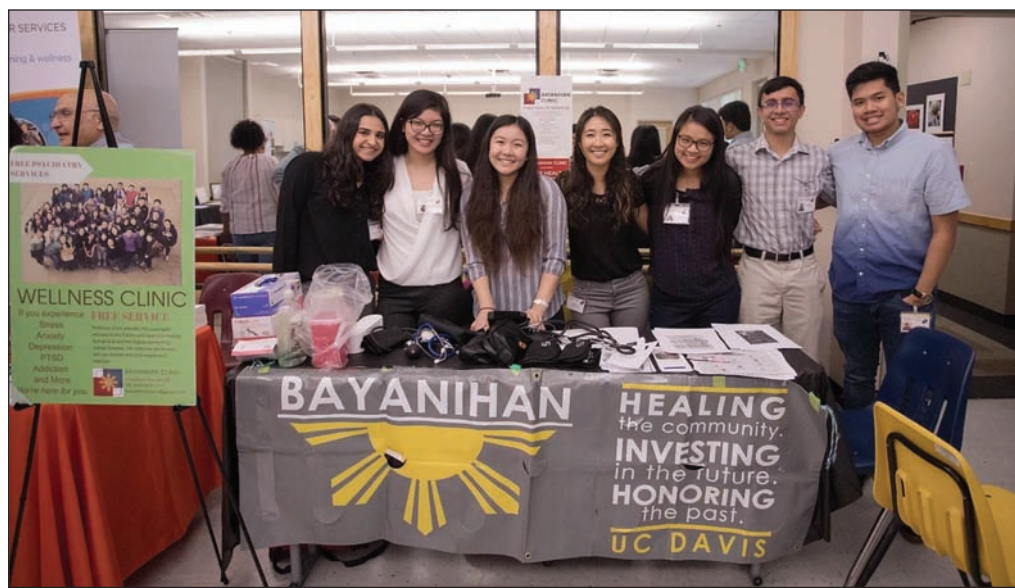
Bayanihan Clinic medical student volunteers

In October of 2002, the group began its efforts to recruit undergraduate clinic volunteers, and specifically targeted Filipino pre-health students in hopes of encouraging students from this underrepresented group to pursue a career in medicine by giving them the rare opportunity of being able to learn and serve while fulfilling community needs. By 2007, Bayanihan Clinic officially joined other student run clinics affiliated with the University of California Medical Center. The UCDMC affiliation has helped clinic in various ways such as having lab services provided by the hospital.