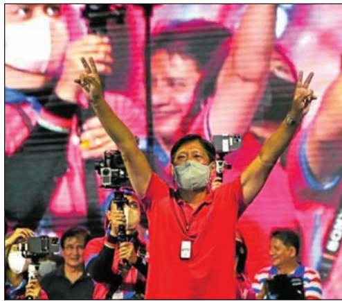
Ferdinand Marcos Jr.

According to Marcos, times have changed and the PCGG can be utilized to go after erring public officials.