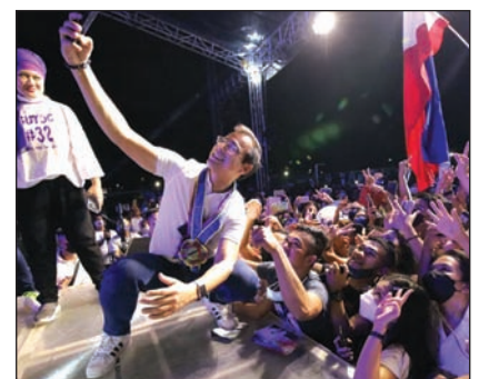
Francisco 'Isko Moreno'

Binalbagan town and Bacolod City in Negros Occidental.