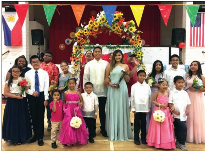
The GTFA 2017 sagalas and their escorts.