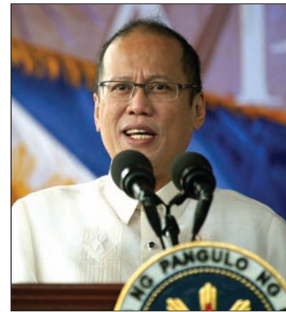
Benigno "Noytoy" Aquino III

All these notwithstanding, Mr. Duterte's support-