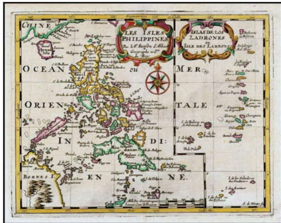
Maps of the Philippines and Islas de las Ladrões

Yes, Magellan, for all intents and purposes, was not on a trip of discovery but on a mission of reconnoitering the famed riches of the Spice Islands, which included Mindanao where, he was told, grew the best cinnamon that could be harvested bountifully.