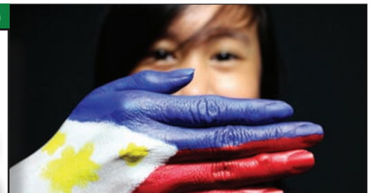
Ang Wikang Pilipino Page 15