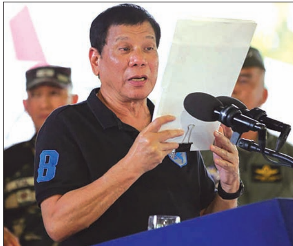
President Rodrigo Duterte warned erring government officials that they would die if they would not reform and stop extortion and other corrupt practices.

"I assure you, pag sinumbong mo na sa akin iyan (if you report it to me), I guarantee you, tawagin ko iyan sa harap mo at sabihin ko talaga, mag-hingi ka uli,