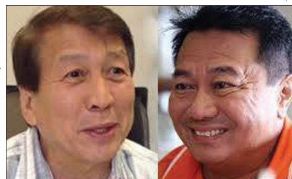
Majority Floor Leader Rudy Fariñas and Speaker Pantaleon Alvarez.

Which makes one wonder what their political plans are in the 2019 midterm election? Imee could run