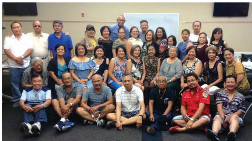
UNLUCAI meeting on July 23, 2017