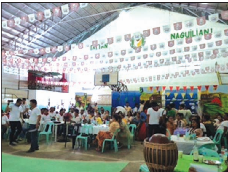
Hall to be used for the Naguilian Global Reunion.