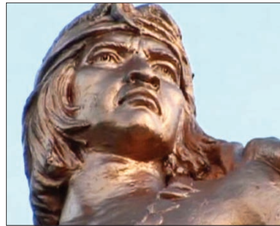
Lapulapu

Magellan was posthumously declared the first to circumnavigate the world. Actually, the first to circumnavigate the world was Enrique, Magellan's servant. Ma-