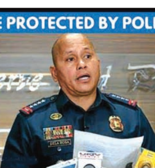
During a recent media briefing, PNP Chief Ronald "Bato" dela Rosa confirmed the Maute group's link to drug lords. He said that the Maute group is known to have "protected" the drug lords as early as last year.

information that majority of the drug lords in Metro Manila, Luzon and Visayas went to Marawi City a year ago to hold a "drug summit." He added that the drug lords were protected by the Maute group and narco-politicians. Surmise it to say, Marawi appears to be the "Vatican" of the illegal drug cartel in the country.