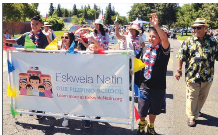
Eskwela Natin at the Filipino Fiesta on June 4, 2017.

The summer program, which is held every Sunday at the County of Sacramento Community Room, Department of Human Resources Building, Florin Road, Sacramento, was completed last July 23. Graduation will be held on July 30 with a reception at 12:00 Noon following the graduation ceremonies.