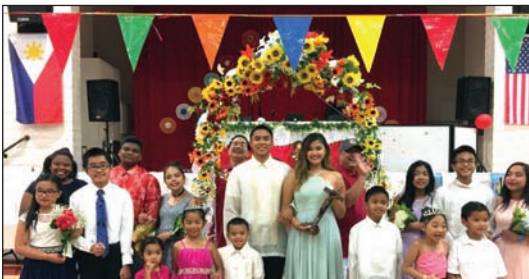
GTFA Fiesta Celebration Page 13