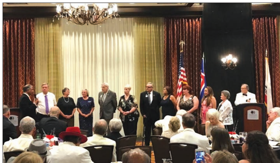
The elected officers of the District 4-C5, Multiple District 4, California (MD-4), Lions Clubs International (LCI).