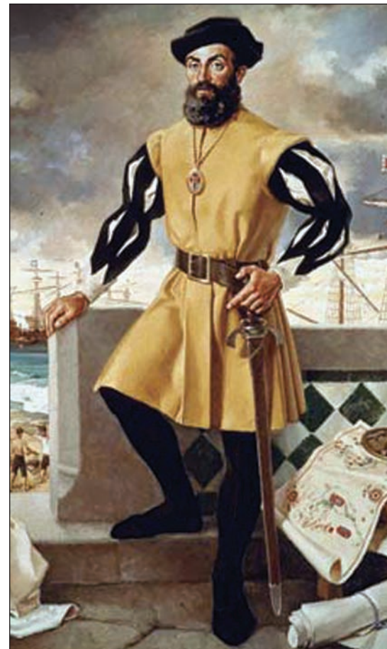
Ferdinand Magellan

world the exact circumference of the Earth. This world was three times definitely larger than the known medieval Ptolemaic maps and accounts. In short, Magellan's ship Victoria sailed from the east (Mactan, Cebu) and sailing from the east, returned to the west (San Lucar, Spain).