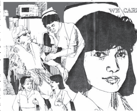
ILLUSTRATION BY DAVE SAN PEDRO

I suspect it is hard to love a nurse, but know this: Your nurse needs your love. Needs