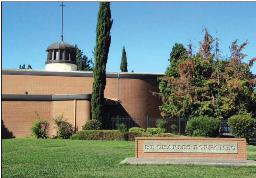
St. Charles Borromeo