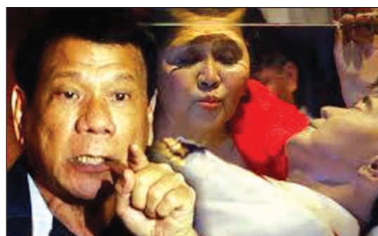
Duterte and Imelda Marcos.