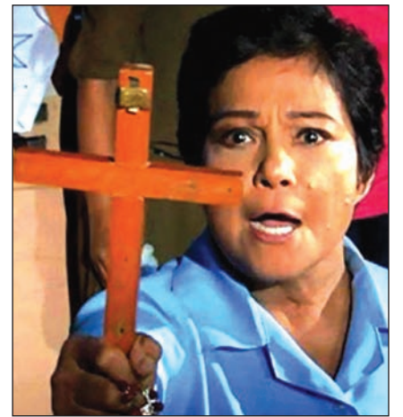
Nora Aunor Stars on TV5’s ‘Untold Stories’ and ‘Third Eye’

Nora Aunor has indeed emerged triumphant, despite the odds and life’s adversities. Now her career is distinguished by critical and popular acclaim: she’s the only Filipino actor whose films have been honored across five continents; she’s well-respected by the country’s culturati and intelligentsia (the only Filipino actress singled out as one of the 100 most influential Filipinos in the last century, recently awarded the Gawad Plaridel by the University of the Philippines; and the Nata-