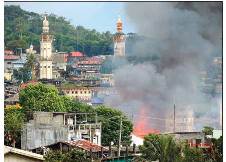
A fire rages at houses following airstrikes by Philippine Air Force in Marawi, southern Philippines, Saturday, May 27, 2017. Philippine military jets fired rockets at militant positions Saturday as soldiers fought to wrest control of the southern city from gunmen linked to the Islamic State group.

True to form, President Rodrigo Duterte's SONA gave pride of place to matters related to peace and order. In addition to the war on drugs, the security situation in Mindanao was an important concern and for very good reason. According to reports, hundreds of fighters have been killed or arrested, nearly a thousand troops have been wounded, hundreds of thousands have been evacuated, and armed groups still threaten the welfare of our people. As weeks pass and the dates pour in, it grows ever