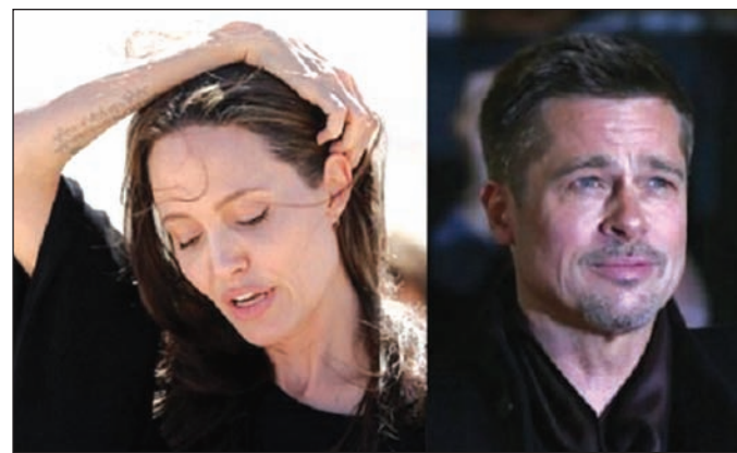
US actress Angelina Jolie (left) has opened up about her split from Brad Pitt (right) and confessed having the ‘hardest time’.

“I’ve been trying for nine months to be really good at just being a homemaker and picking up dog poop and cleaning dishes and reading bedtime stories. And I’m getting bet-