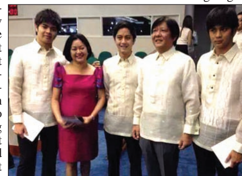
Former Senator Bongbong Marcos and his wife and three sons.

With the proxy war that is going on between Duterte and Imelda, the calculus for the presidential election in 2022 is going to