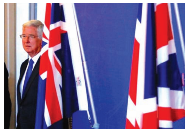
Britain's Secretary of State for Defence Michael Fallon arrives for a media conference in Sydney, Australia.

islands and military facilities in the South China Sea has stoked international condemnation, amid concern Beijing is seeking to restrict free movement and extend its strategic reach.