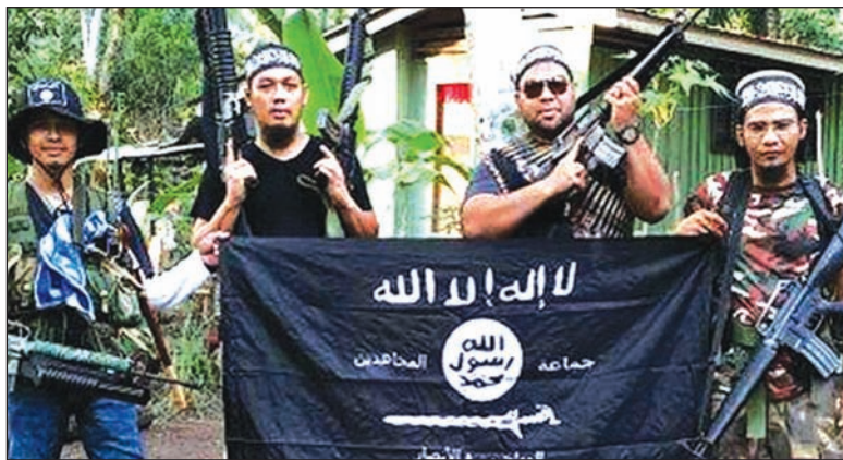
Abu Sayyaf militants show ISIS flag.