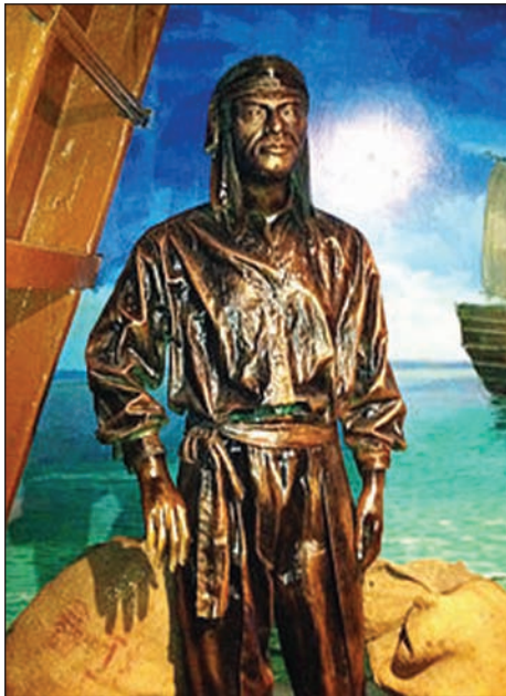
Enrique of Malacca

East was an innovative plan. His Moluccas armada was prepared for a long journey. It was stocked with food, items for barter and numerous gifts. He was given five ships: Trinidad, San Antonio, Santiago, Concepcion, and the Victoria, all bearing Spanish flags.