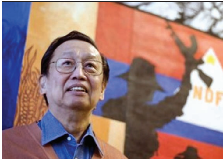
Jose Ma. Sison, Communist Party of the Philippines (CPP) founder.

President Rodrigo Duterte "is out of his mind and out of touch with reality" if he thinks he can finish off the communist insurgency in the next five years of his six-year term, Jose Ma. Sison, Communist Party of the Philippines (CPP) founder, said on Sunday.