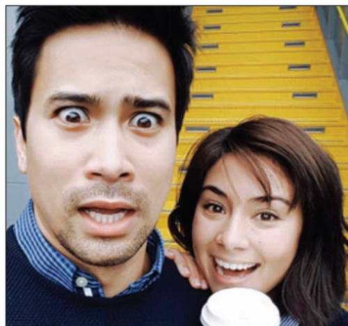
Singer-actor Sam Milby sees a future with present girlfriend, TV host Mari Jasmine.

“I don’t want to get music out of my system,” he explains. So the album marks Sam’s