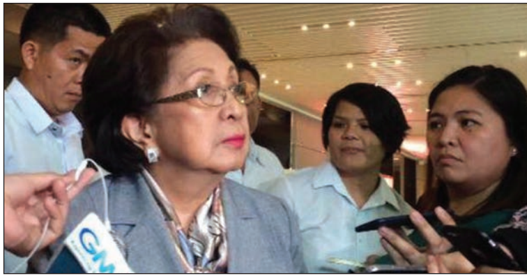
'ANO ANG PAKIALAM NIYA?' Ombudsman Conchita Carpio Morales on July 28, 2017 says she does not need clearance from anyone to investigate erring officials.

of the Ombudsman can proceed with an investigation even without the participation of respondents, if there is probable cause based on evidence at hand.