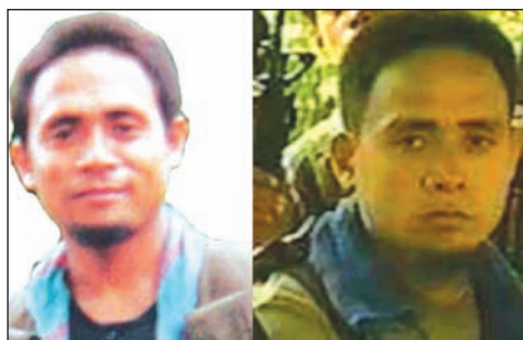
Two faces of Abu Sayyaf leader Isnilon Totononi Hapilon.

about peace and negotiate a ceasefire after the heavy bombing and fighting in Marawi City. Duterte turned her offer down, saying the government forces