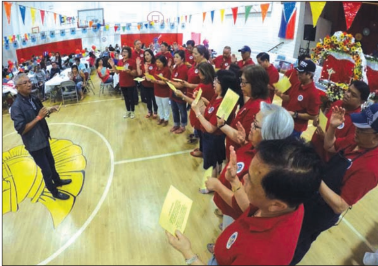
The newly elected officers of GTFA for 2017 - 2019

The officers look forward to serve the Gentry Family to the best of their ability with everyone help and support. And of course, with the guidance of the Lord Jesus Christ and the Saint Francis Of Assisi.